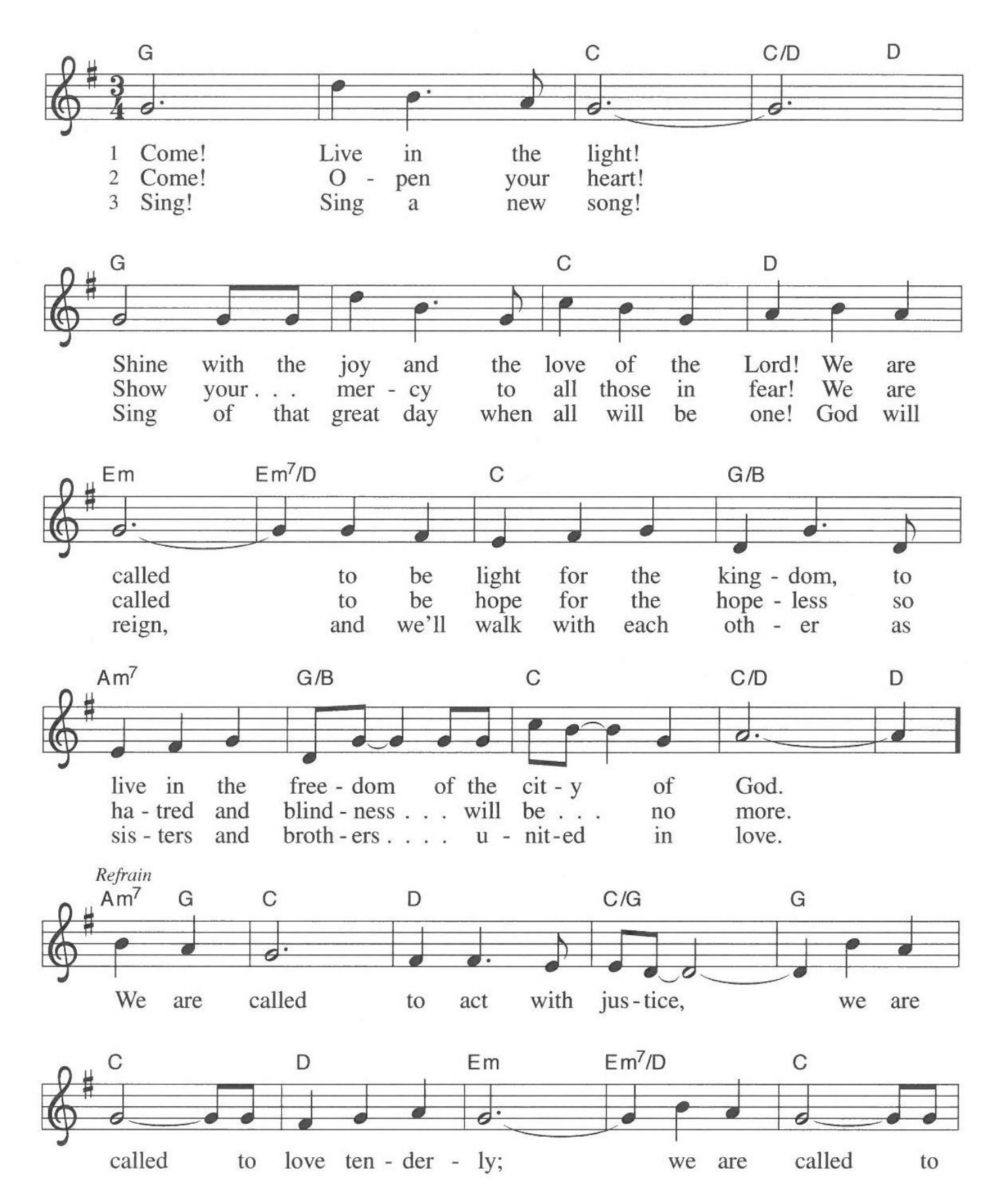
We Are Called